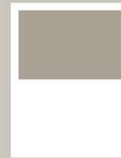
Half Page Ad 7 1/2" x 4 3/4"