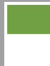
Half Page Ad 7 1/2" x 4 3/4"