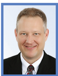
EVP, CFO United Valley Bank Cavalier

I look forward to serving as NDBA Chairman this year and hope to see you the week of September 12-15.