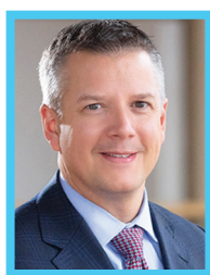
SVP Ag Banking Director Bell Bank Fargo