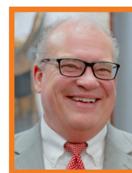
SVP, Chief Lending Officer American State Bank and Trust Williston