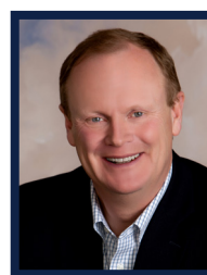
NDBA President & CEO Bismarck